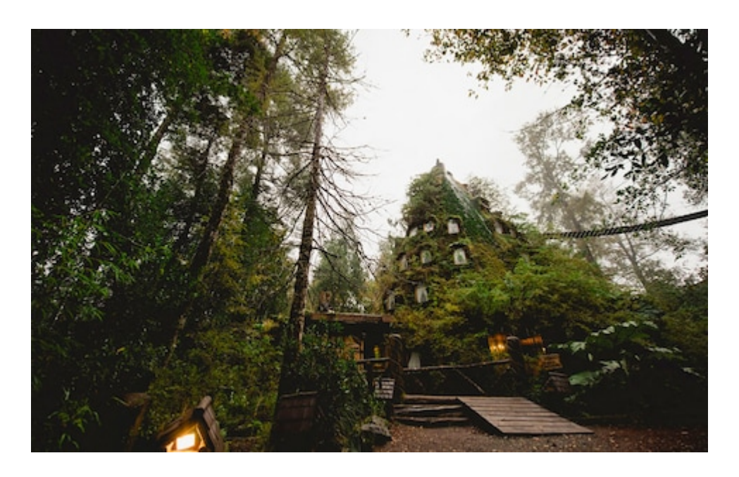
2.The Caves, Negril, Jamaica

The Caves enjoys a stunning cliffside location in Negril. Accommodation is comprised of just 12 variously configured, secluded cabins set in jungle-like gardens at the top of the cliffs. The caves themselves are used for private cande-lit dining — a once-in-a-lifetime experience.